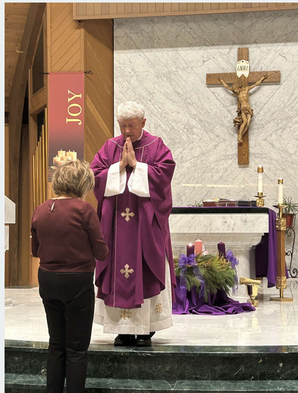
6 pm Mass