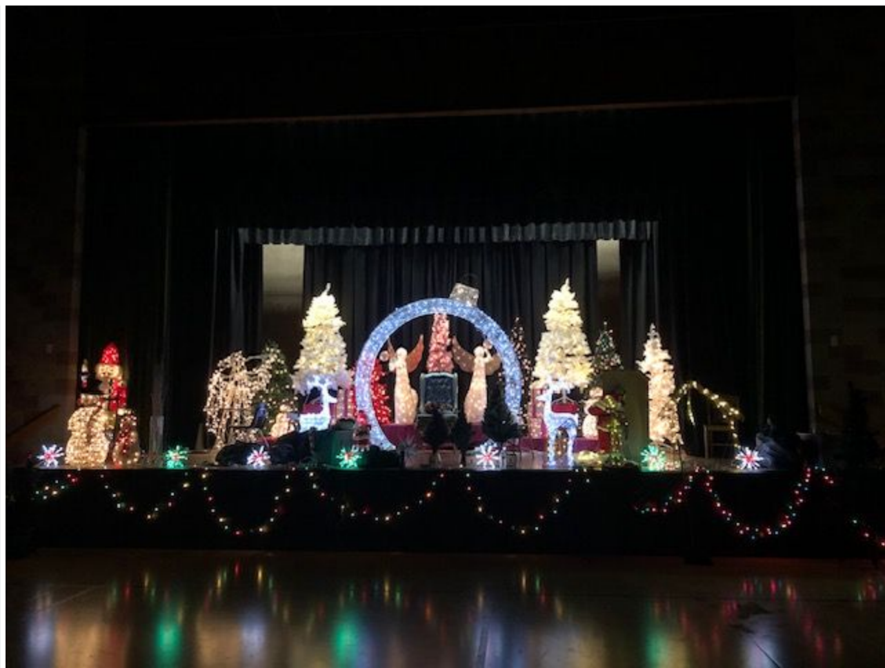
Widows Circle Christmas Potluck Celebration