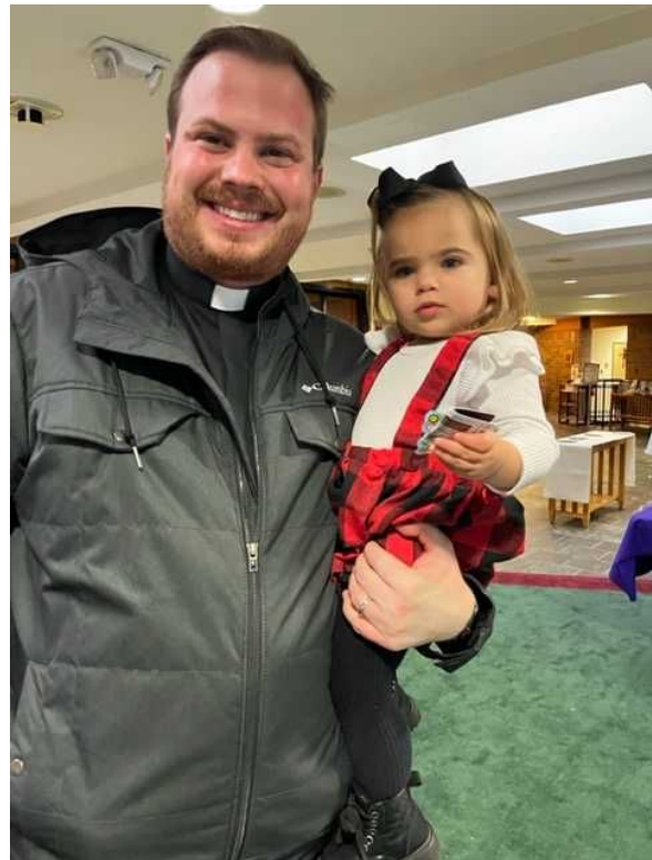
11:30 am Mass