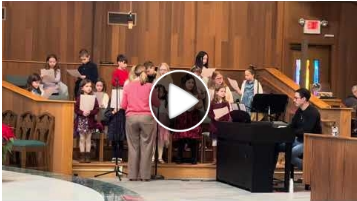
6 pm Mass